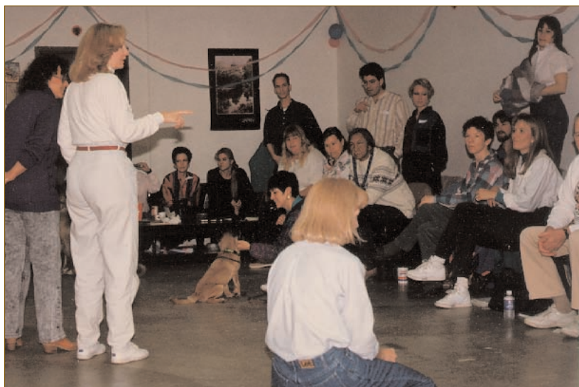
Not a bad start: eighteen people to meet one three-month-old puppy

Capitalize on the time your pup needs to be confined indoors by inviting people to your home. Your pup needs to socialize with at least a hundred different people before he is three months old. I know this may sound like a bit of an ordeal, but it is